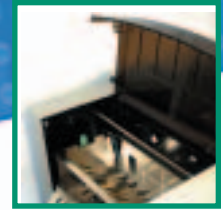
User friendly interface for on-line processing