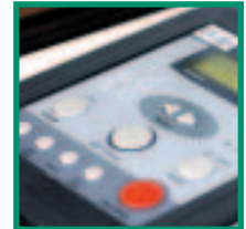
detailed control panel with total and batch count as standard